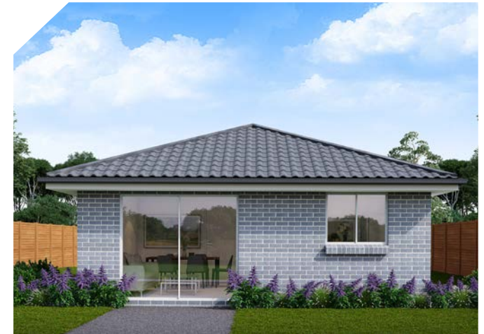
FACADE STYLE A

Items may be displayed in our homes that are not included in our standard specifications. Display Home Options, including façade upgrades, window upgrades, brick upgrades, kitchen and bathroom upgrades, light fittings, down lights, feature walls, upgraded tiling, floor coverings, window coverings, all external landscape including retaining walls, timber porch and patio, decking, pergolas, rainwater tanks are not included. Unless noted, no concrete slab or pad provided to any external area. All point of sale and marketing material are for illustrative purposes only and it is the client's responsibility to satisfy themselves as to their understanding. Champion Homes gives no warranty and make no representation as to the accuracy or sufficiency of any description, illustration, photograph or statement contained in this document and accepts no liability for any loss which may be suffered by any person who relies either wholly or in part upon the information presented. Photographs and illustrations in this brochure are intended to be a visual aid only. All information provided is subject to change without notice. Floor plan size may vary according to façade selected. Copyright© This plan is the property of Champion Homes and may not be used in whole or part. Legal action will be taken against any person who infringes the Copyright. January 2020. * All drawings and images are for illustrative purposes and are used as a visual guide only.