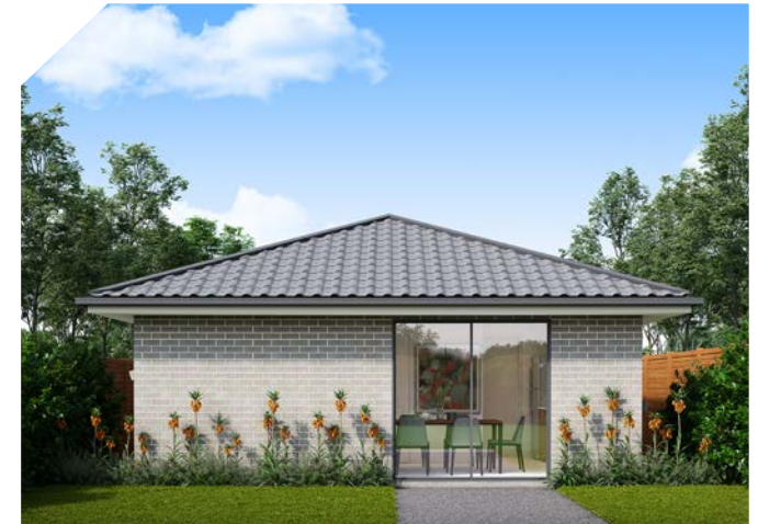
FACADE STYLE A

Items may be displayed in our homes that are not included in our standard specifications. Display Home Options, including façade upgrades, window upgrades, brick upgrades, kitchen and bathroom upgrades, light fittings, down lights, feature walls, upgraded tiling, floor coverings, window coverings, all external landscape including retaining walls, timber porch and patio, decking, pergolas, rainwater tanks are not included. Unless noted, no concrete slab or pad provided to any external area. All point of sale and marketing material are for illustrative purposes only and it is the client's responsibility to satisfy themselves as to their understanding. Champion Homes gives no warranty and make no representation as to the accuracy or sufficiency of any description, illustration, photograph or statement contained in this document and accepts no liability for any loss which may be suffered by any person who relies either wholly or in part upon the information presented. Photographs and illustrations in this brochure are intended to be a visual aid only. All information provided is subject to change without notice. Floor plan size may vary according to façade selected. Copyright© This plan is the property of Champion Homes and may not be used in whole or part. Legal action will be taken against any person who infringes the Copyright. January 2020. * All drawings and images are for illustrative purposes and are used as a visual guide only.