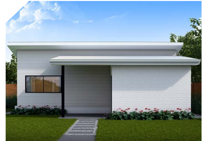
FACADE STYLE E

Items may be displayed in our homes that are not included in our standard specifications. Display Home Options, including façade upgrades, window upgrades, brick upgrades, kitchen and bathroom upgrades, light fittings, down lights, feature walls, upgraded tiling, floor coverings, window coverings, all external landscape including retaining walls, timber porch and patio, decking, pergolas, rainwater tanks are not included. Unless noted, no concrete slab or pad provided to any external area. All point of sale and marketing material are for illustrative purposes only and it is the client's responsibility to satisfy themselves as to their understanding. Champion Homes gives no warranty and make no representation as to the accuracy or sufficiency of any description, illustration, photograph or statement contained in this document and accepts no liability for any loss which may be suffered by any person who relies either wholly or in part upon the information presented. Photographs and illustrations in this brochure are intended to be a visual aid only. All information provided is subject to change without notice. Floor plan size may vary according to façade selected. Copyright© This plan is the property of Champion Homes and may not be used in whole or part. Legal action will be taken against any person who infringes the Copyright. January 2020. * All drawings and images are for illustrative purposes and are used as a visual guide only.