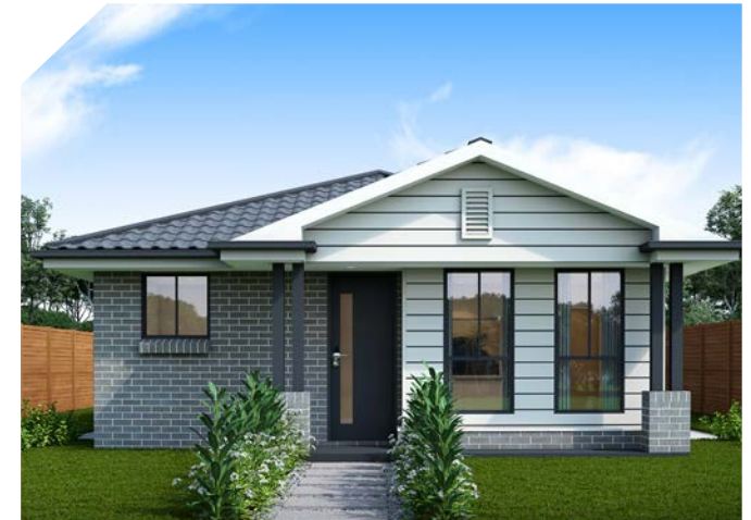
FAÇADE STYLE C

Items may be displayed in our homes that are not included in our standard specifications. Display Home Options, including façade upgrades, window upgrades, brick upgrades, kitchen and bathroom upgrades, light fittings, down lights, feature walls, upgraded tiling, floor coverings, window coverings, all external landscape including retaining walls, timber porch and patio, decking, pergolas, rainwater tanks are not included. Unless noted, no concrete slab or pad provided to any external area. All point of sale and marketing material are for illustrative purposes only and it is the client's responsibility to satisfy themselves as to their understanding. Champion Homes gives no warranty and make no representation as to the accuracy or sufficiency of any description, illustration, photograph or statement contained in this document and accepts no liability for any loss which may be suffered by any person who relies either wholly or in part upon the information presented. Photographs and illustrations in this brochure are intended to be a visual aid only. All information provided is subject to change without notice. Floor plan size may vary according to façade selected. Copyright© This plan is the property of Champion Homes and may not be used in whole or part. Legal action will be taken against any person who infringes the Copyright. January 2020. * All drawings and images are for illustrative purposes and are used as a visual guide only.