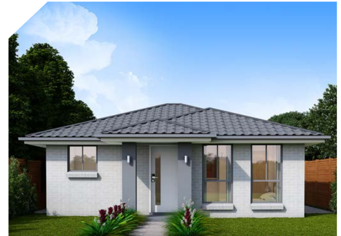
FACADE STYLE B

Items may be displayed in our homes that are not included in our standard specifications. Display Home Options, including façade upgrades, window upgrades, brick upgrades, kitchen and bathroom upgrades, light fittings, down lights, feature walls, upgraded tiling, floor coverings, window coverings, all external landscape including retaining walls, timber porch and patio, decking, pergolas, rainwater tanks are not included. Unless noted, no concrete slab or pad provided to any external area. All point of sale and marketing material are for illustrative purposes only and it is the client's responsibility to satisfy themselves as to their understanding. Champion Homes gives no warranty and make no representation as to the accuracy or sufficiency of any description, illustration, photograph or statement contained in this document and accepts no liability for any loss which may be suffered by any person who relies either wholly or in part upon the information presented. Photographs and illustrations in this brochure are intended to be a visual aid only. All information provided is subject to change without notice. Floor plan size may vary according to facade selected. Copyright© This plan is the property of Champion Homes and may not be used in whole or part. Legal action will be taken against any person who infringes the Copyright. January 2020. * All drawings and images are for illustrative purposes and are used as a visual guide only.